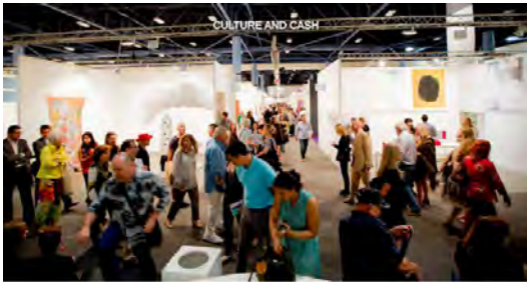
Art Basel is held inside the Miami Beach Convention Center; above, Wynwood Walls, left, has a changing array of public art in the Wynwood Art District north of downtown Miami